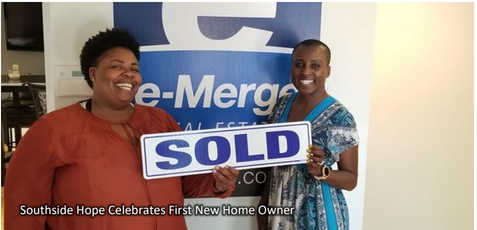
Southside Hope Celebrates First New Home Owner

For more information, visit southsidehope.org .